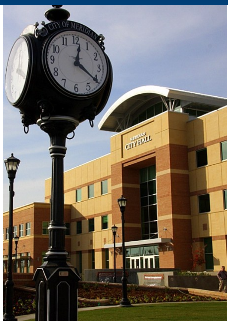
The City's clock chime was restored, bringing back the "hometown" appeal of downtown Meridian